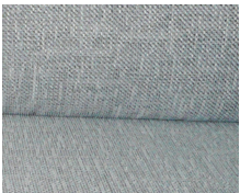
+ Upholstery Drake