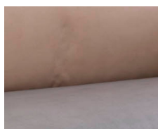
+ Duke upholstery *