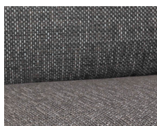
+ Floyd upholstery