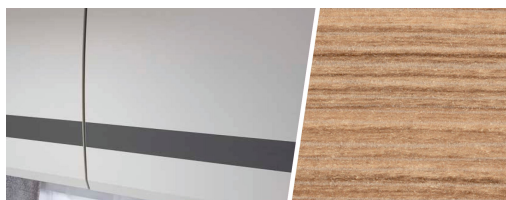
+ Rosario Cherry wood décor