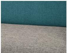
+ Clipper upholstery