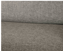
+ Portobello upholstery *