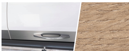
+ Amber Oak wood décor