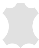
+ Real leather individual ○