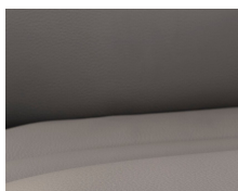
+ Real leather upholstery Colin ○