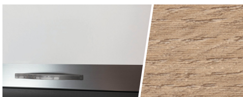
+ Wood décor Amberes Oak