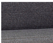
+ Upholstery Melia ○