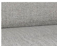
+ Upholstery Samir