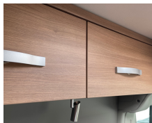
+ Wood décor Cape Town