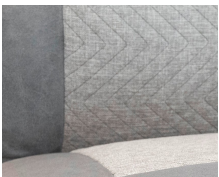
+ Upholstery Hygge