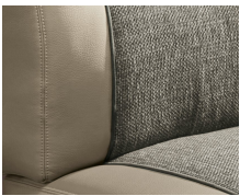
+ Upholstery Camino