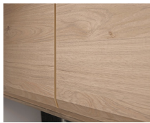
+ Wood décor Noce Nagano