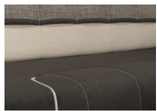
+ Amaro + Goa