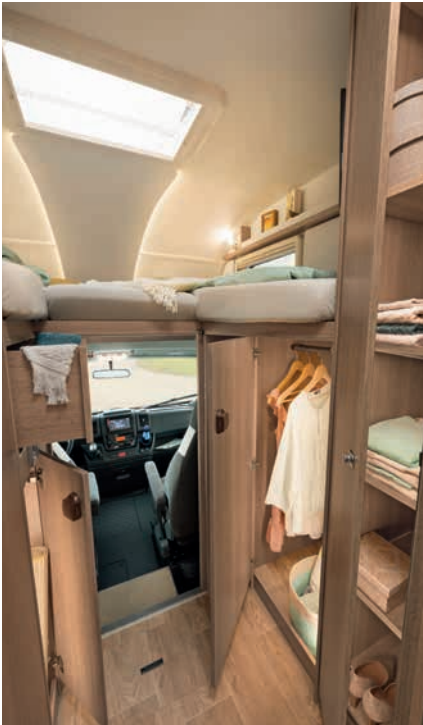
» Spacious, illuminated wardrobes with drawers (pic. Coachbuilt). Cab can be separated with a sliding door for additional cold and light protection