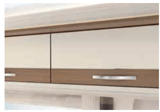
+ Virginia Oak