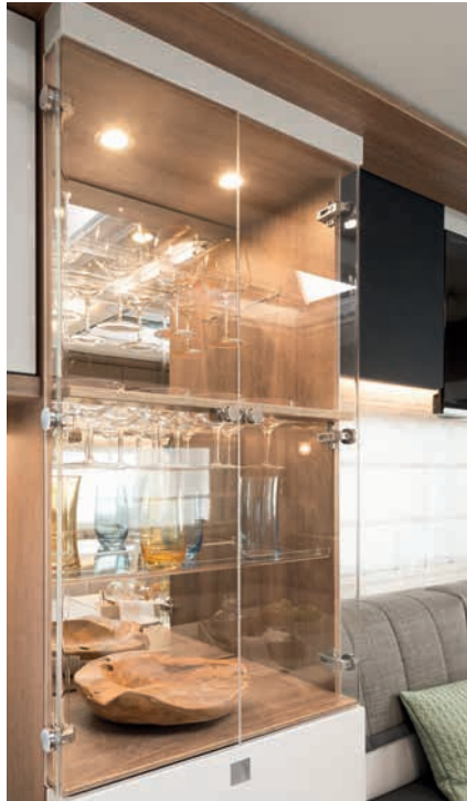
» Feel like at home: modern vitrine (not for A 6820-2)