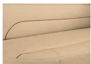
+ Skylight (real leather, option)