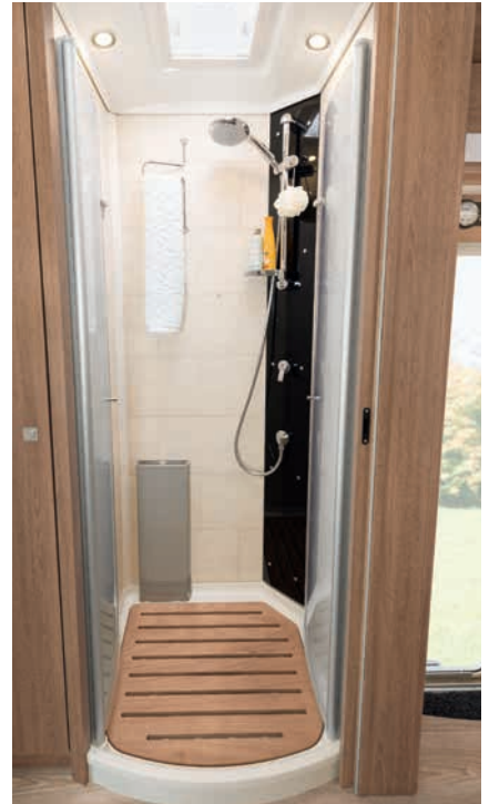
» Much elbow room provided by the separate shower cubicle with Plexiglass doors