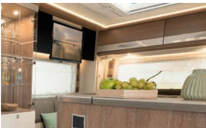
» Large 32" TV (option)