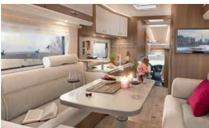
» Huge U-shape lounge and much elbow room