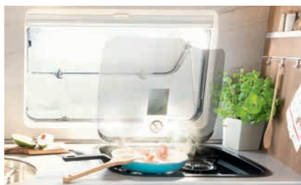
» Generous kitchen with 3-burner gas stove, rail system and central locking for the kitchen drawers