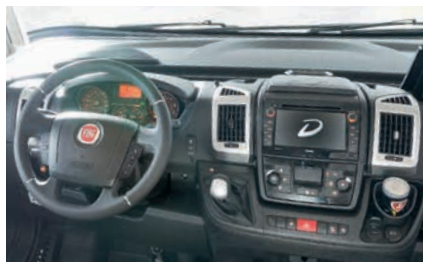
» Leather steering wheel and gear knob in dashboard with chrome rings for Fiat Chassis (multifunction steering wheel optional)