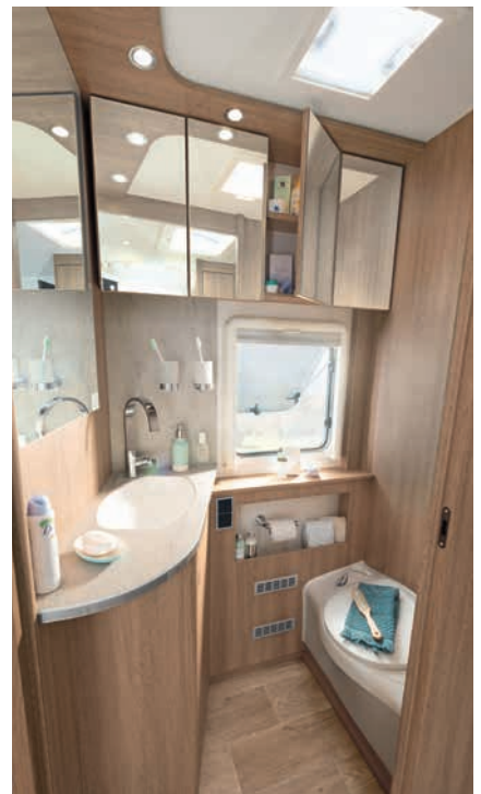
» Your spa with daylight and great comfort