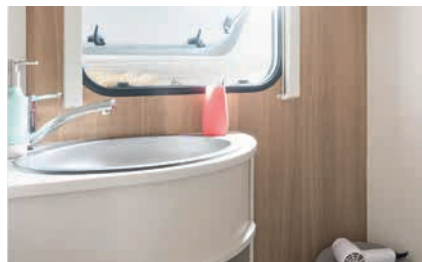
» Elegant wash bowl made of stainless steel