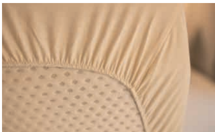
» Cold foam mattresses for all fixed single and double beds