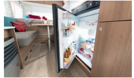
» Big fridge with 81 l volume and 10 l freezer (variances see technical data)