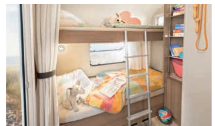
» 2 bunk beds or optional 3 bunk beds (variances see technical information)