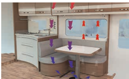
» AirPlus - perfect air circulation in the interior and ventilation behind the overhead lockers