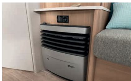
» Powerful warm air heating