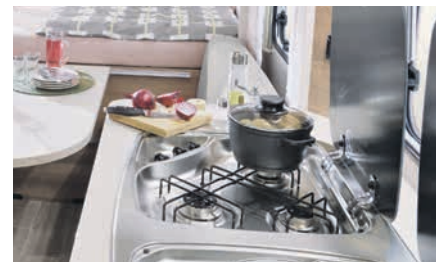
» Practical 3-flames cooker with manual ignition