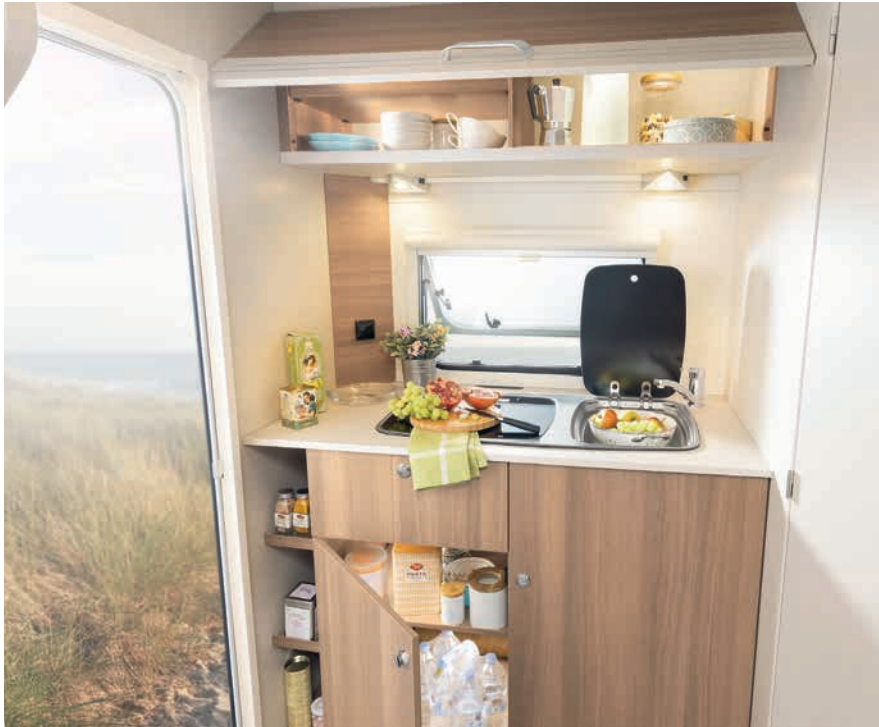
» Spacious kitchen overhead lockers