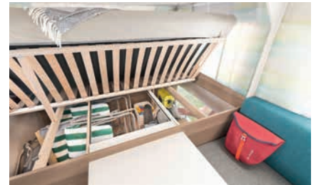
» Special slatted frame with flexible natural rubber holders, adjustable for optimal use of storage compartments underneath the beds