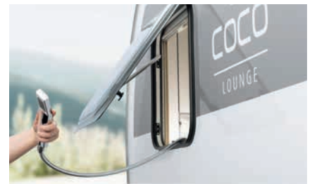
» Opening window in bathroom with extendable shower fitting (Glamping Package)