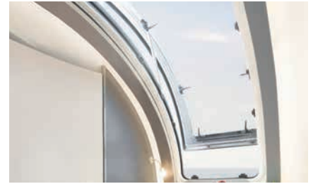
» Imposing, openable front window with blind and flyscreen (Glamping Package)