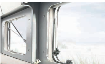
» Attractive window frames with chrome trim (Glamping Package)