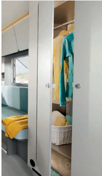
» Spacious wardrobe with cloth rail and linen shelf