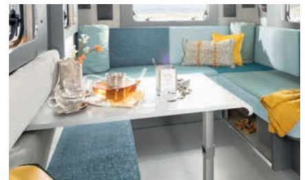
» Movable design table