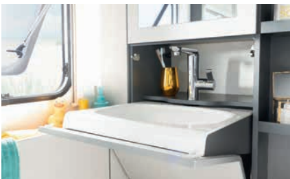
» Space-saving and fold-away wash bowl for easy stowage in vanity unit