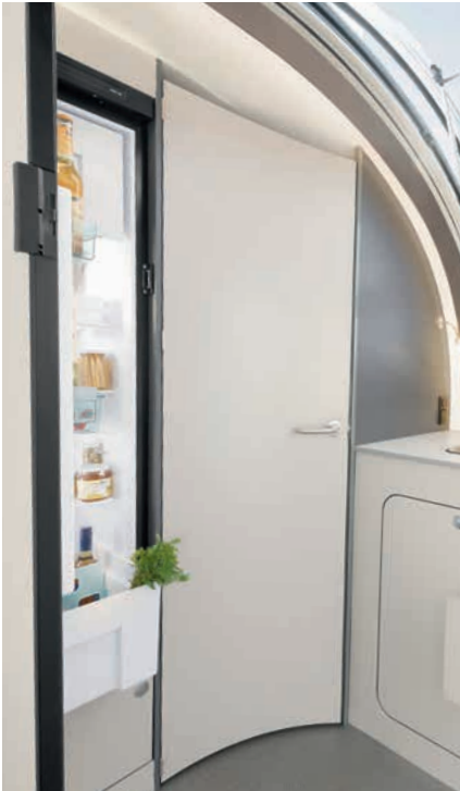
» Large fridge with 142 l volume and 15 l freezer