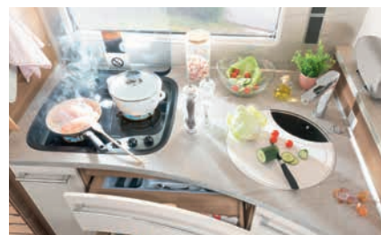
» Large kitchen worktop with extra space for the coffee machine