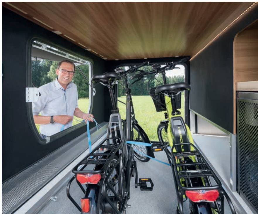
» Huge rear garage accessible from three sides on request