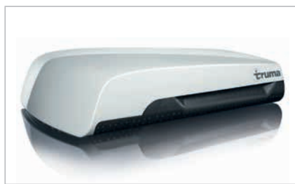
» Powerful roof air conditioner (option)