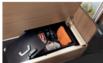
» Anti-theft safe