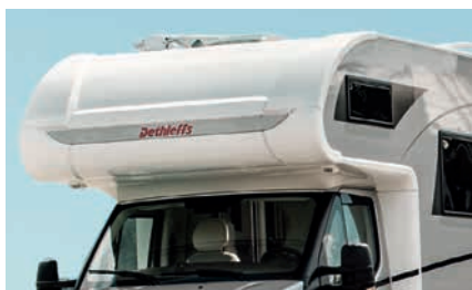
» Large overcab with 200 x 155 cm lying surface