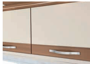
+ Almeria Ash White