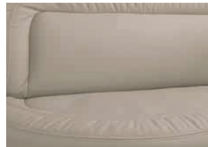
+ Meran (real leather, option)