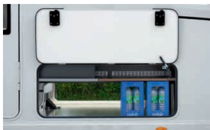
» Storage space in the double floor