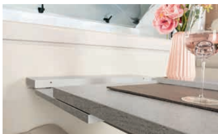
» Table top extension