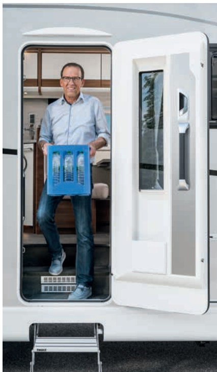
» Sturdy habitation door with large window