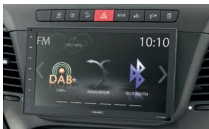
» Multimedia: Dethleffs Naviceiver incl. DAB+ (option)