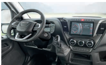
» Extensively equipped driver's cab