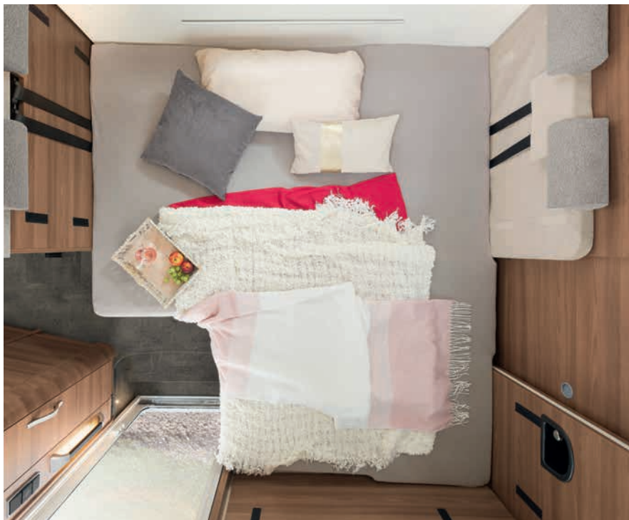
» Quick seating group conversion to an additional sleeping place