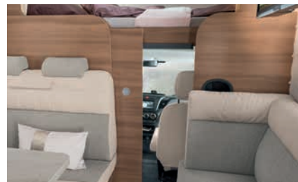
» Driver's cab separable by wooden sliding door