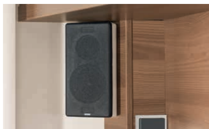
» Sound system (option)