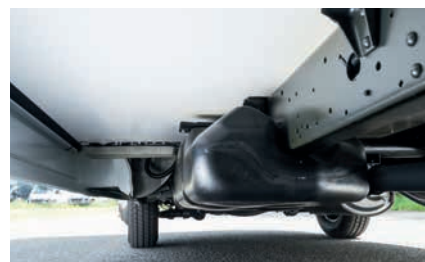
» GRP covered underfloor