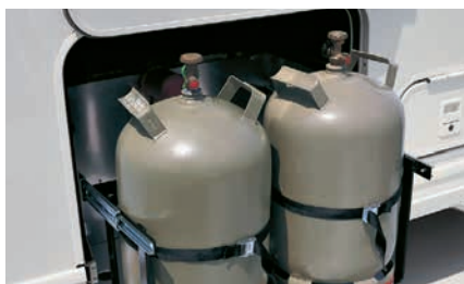
» Comfortable gas bottle drawer